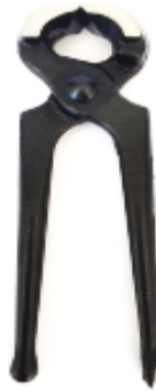
Figure 1. The plier used in this study.