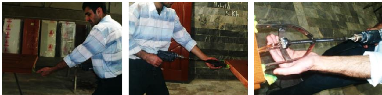
Figure 4. The ergonomically designed nail removal device.

duration of one nailing activity (sec)” were measured as the main criteria for assessment of the manual task. These two variables were compared while using both pliers and ergonomics nail removal devices. Moreover, Strain Index (SI) and Rapid Entire Body Assessment (REBA) techniques were used in order to the effectiveness of the designed device. In this sense, photography/videotaping of the target tasks were done from the sagittal plane for further investigation and for extracting the required data.