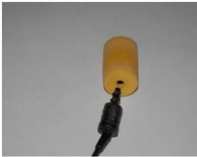
Fig 1. Earplug with microphone