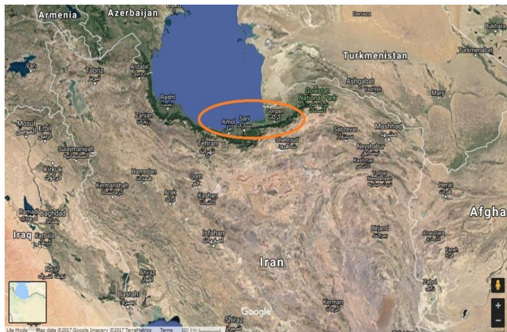
Fig.1. Study area, Northern Iran

The study area of this research was the city of Sari located at the longitude of 53^{\circ}5'E and latitude of 36^{\circ}34'N of the plain region of Sari county, northern Iran (Fig.1). Sari with a population of about 296,417 people and an area of about 2852 (km 2 ) has only five urban parks which their total area is about 113,385 hectare. Therefore, the urban parks area is about 0.39 hectare per capita [10].